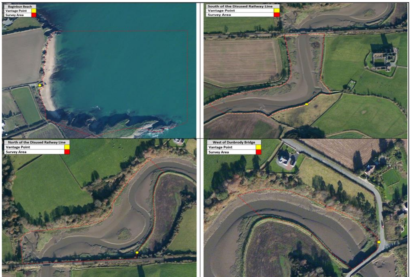
Figure 2: vantage point location for the winter bird counts.